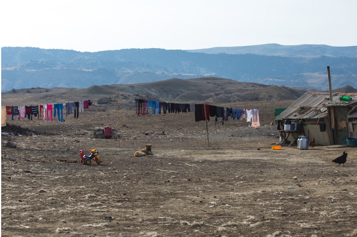
There is only one farm remained at pastures N15, 16 and 17. Four farmers with their families and five hired shepherds are living there. They have in total up to 1500 sheep, 20 cows and 10 horses.