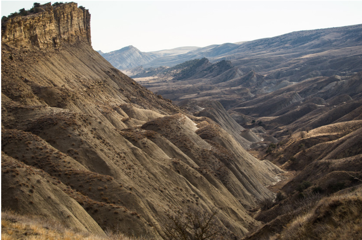
Pic. Ravine, area of winter pasture N8

It should be also noted, that these pastures were chosen as study area, because they were not registered and government implies them as free. In soviet times they belonged to local collective farms. But according to the local farmers it was revealed that these pastures are in a long-term lease (49 years) issued in 1995-96 and the whole area with its farms is rented. Therefore the status of supposed free, winter pastures, presented at this study, became undefined.