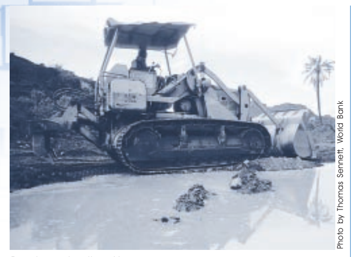
Road construction, Yemen

approaches. However, one of the lessons from Bank experience has been that NPS projects, especially those in rural communities, require community participation to be successful. To give these communities some standing in discussions about NPS management, it is important to provide a governmental mandate, such as an official policy requiring their involvement.