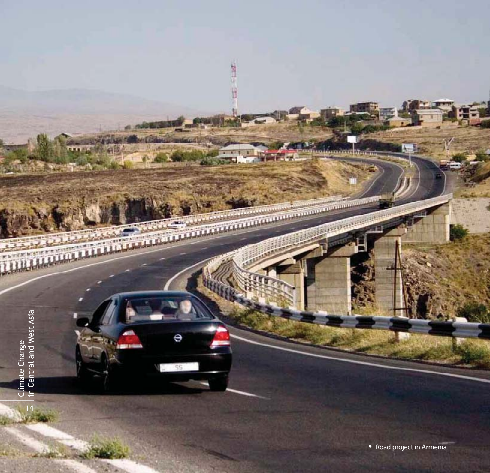
• Road project in Armenia