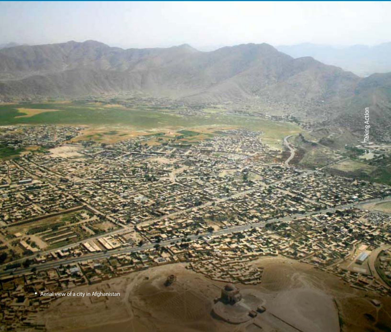
• Aerial view of a city in Afghanistan

Given the anticipated impacts of climate change and glacial melt in the Western Himalayas, where possible ADB will align its operations for water and hydro energy in localized river basins with risk management and adaptation practices.