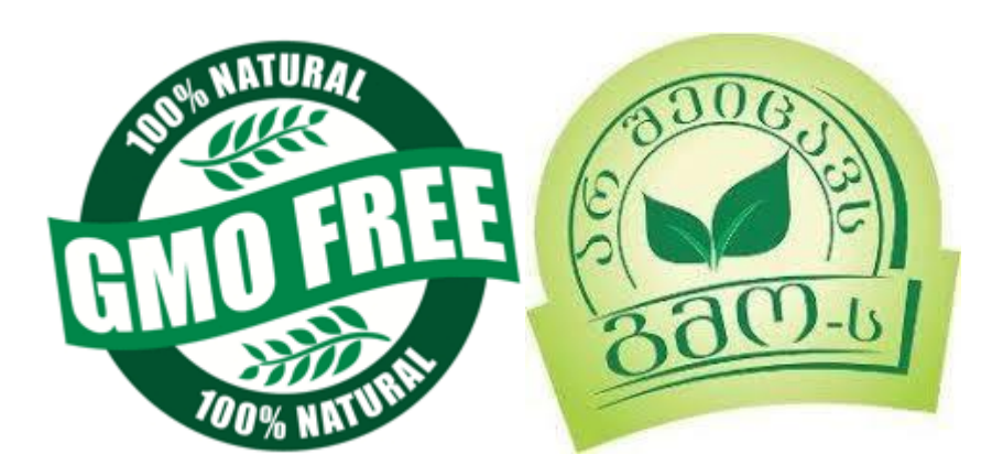
Figure 8. Marks for GMO free products.

Besides that, there are various technical regulations and requirements for specific production, such as groceries and wine. The purpose of all these regulations is to properly inform consumers. In addition, requirements for product labelling of dangerous chemical substances are also provided.