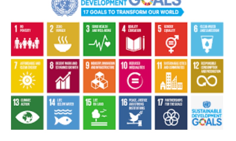
Figure 4. UN Sustainable Development Goals.

Therefore, eco-labeling is relevant to each SDG target and contributes to its implementation. It can be considered as an additional tool that ultimately ensures the achievement of Agenda 2030.